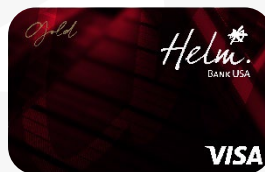
Helm Visa Gold