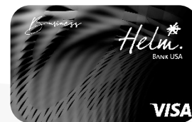
Helm Visa Business